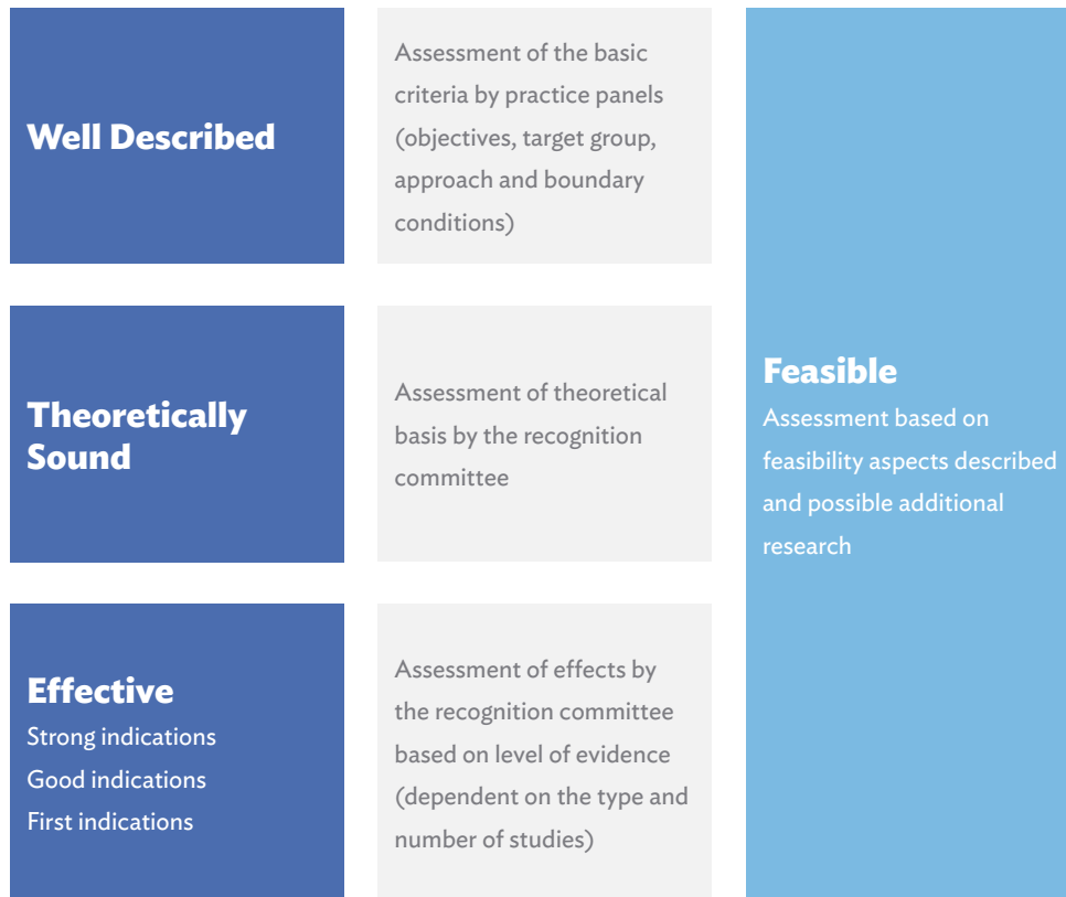
FIGURE 2: LEVELS OF ASSESSMENT ACCORDING TO THE DUTCH RECOGNITION SYSTEM

Below the elaborated criteria are presented for: